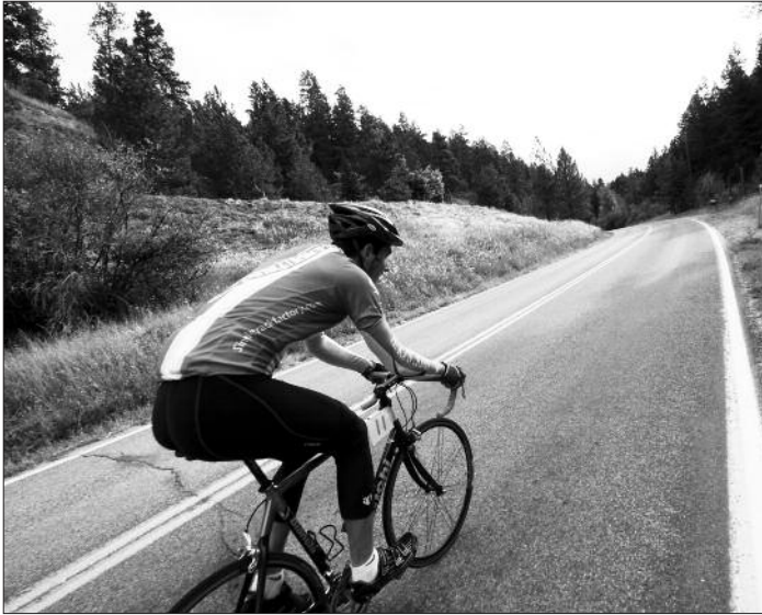
The Hill Climb course hasn't changed in thirty-three years.

Missoulians On Bicycles (MOBI) invites you to take part in what is Montana's oldest annual competitive cycling event. The Hill Climb traditionally closes Montana's road racing season, but it is