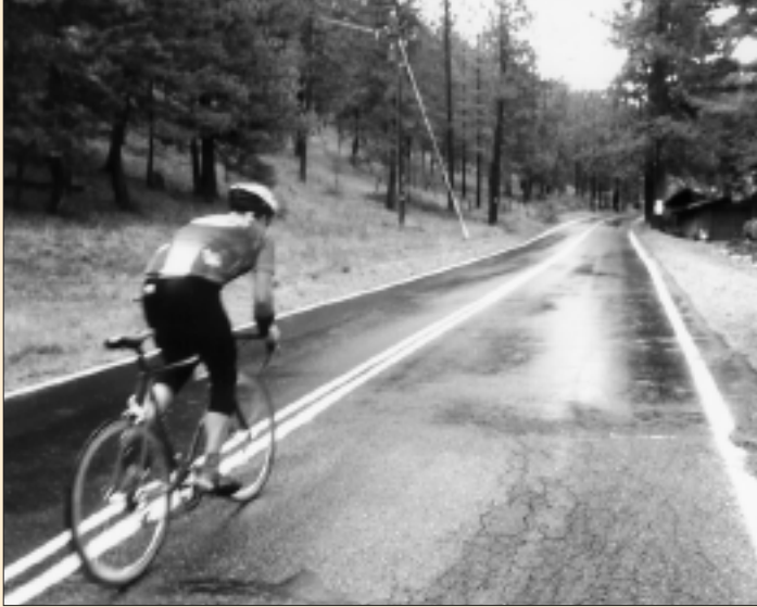
The Hill Climb course hasn't changed in thirty-two years.

Missoulians On Bicycles (MOBI) invites you to take part in what is Montana's oldest annual competitive cycling event. The Hill Climb traditionally closes Montana's road racing season, but it is